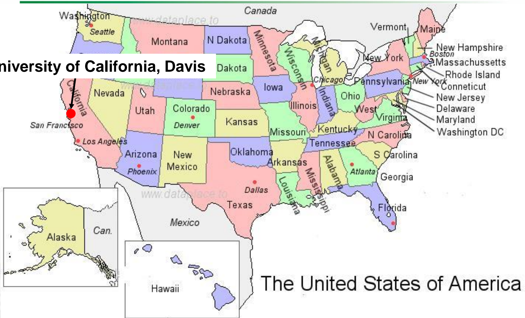
The United States of America